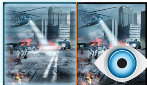
FLICKER FREE + BLUE LIGHT

With a height adjustable stand you will create an ergonomic work posture and position that meets all health and safety requirements. This will not only prevent any health issues but will also increase your productivity. The pivot function allows the screen to rotate from landscape to portrait orientation. This functionality can be useful if the application requires more height than width.